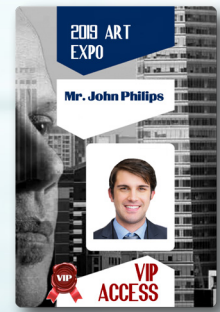
Oversized ID badge