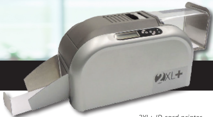
2XL+ ID card printer

Events such as concerts, tradeshows, and sports competitions require maximum security. The 2XL+ card printer for oversized badges is the professional solution to issue durable badges on demand.