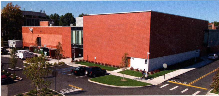
A campus-wide security solution at Adelphi University encompasses the Performing Arts Center, viewed from the stands of a nearby athletic field.

Along with other potential vendors, Idesco submitted its bid and worked with Adelphi on revisions to fine-tune the requirements, meet budget goals and build in future-proofing. It quickly became clear that it would be a very collaborative effort given Adelphi's level of security sophistication. The university's existing life-safety and security systems included card access, ID management, fire alarms, panic and duress alarms, emergency call boxes, and emergency notification.