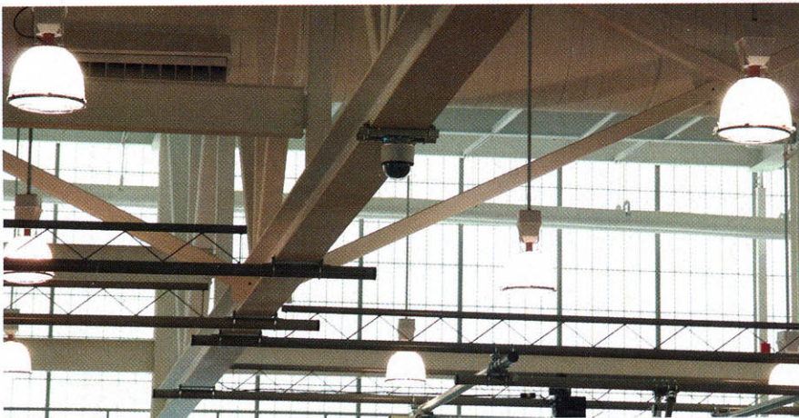
Three stories up, an Axis 233D camera monitors the main gymnasium and running track inside Adelphi's new sports center.

tract," says Silver. "It allows end users to best allocate their own resources, while knowing the new system will be properly maintained and supported."