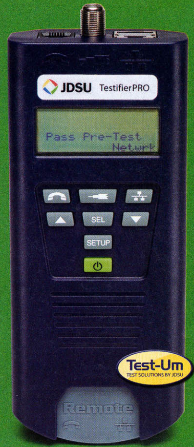
TestifierPRO™ Cable Tester TP650