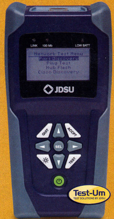
LanScaperPRO™ Cable and Network Tester NT800